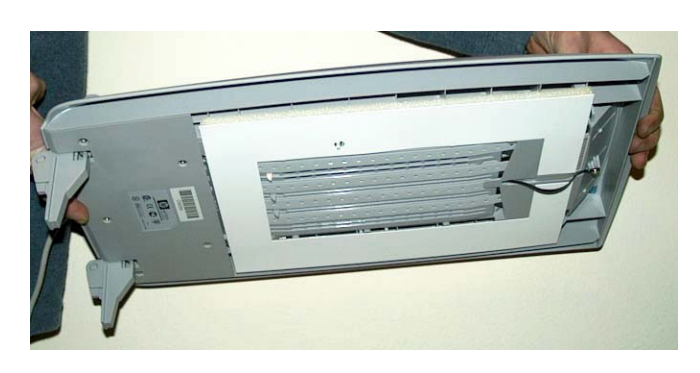
Figure 2. Underneath Side of APF

The pick mechanism begins the scanning process by picking up one and only one photo. It uses a passive separation system vs. the active system used on most document feeders. The passive system is gentler by using a roller to push down on the stack of photos allowing only one photo to bypass a built-in shelf.