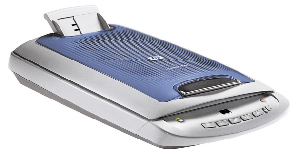
Figure 1. HP Scanjet 5550c Scanner with Automatic Photo Feeder

The automatic photo feeder is divided into three logical parts: the pick mechanism, the transport mechanism, and the eject mechanism.