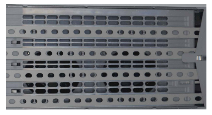
Figure 3. Four Belts and Three Deskew Fingers

one-way deskew fingers. The belts then reverse to move the photo backwards until the photo stops on the first deskew finger sensor. The belts continue in reverse until touching aligns the photo edge to all three deskew fingers. This also detects the length of the photo. Now the belts are returned to their normal, scanning direction.